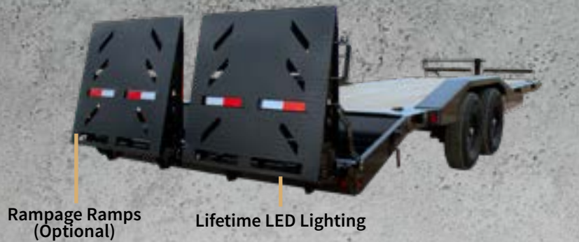
Rampage Ramps (Optional) Lifetime LED Lighting