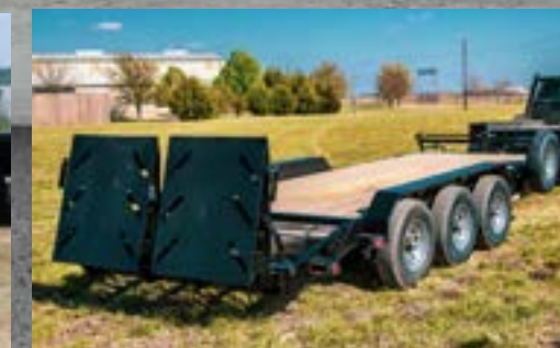
Triple Axles, Rampage Ramps