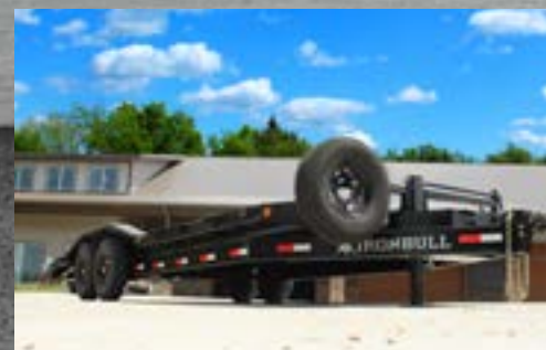
102 Wide, Spare Mount