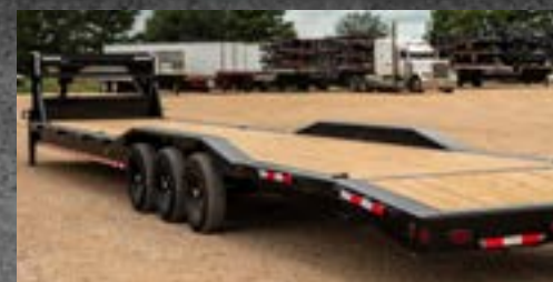
102 Wide, Triple Axle