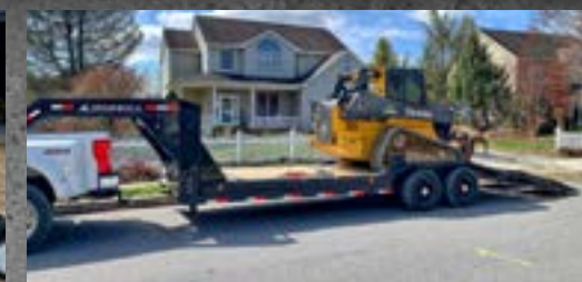
Tandem Axle, Rampage Ramps