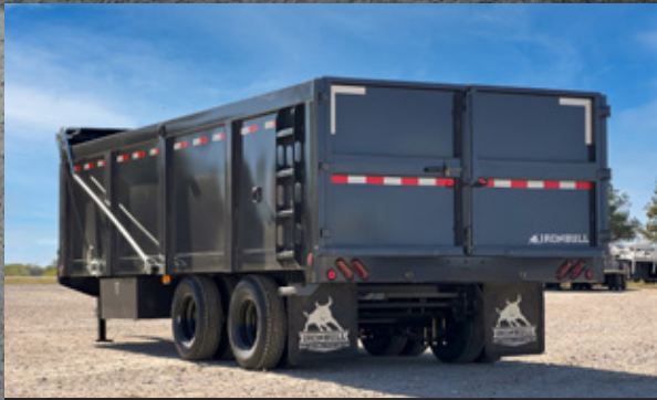
SQUARE BOTTOM FLOOR