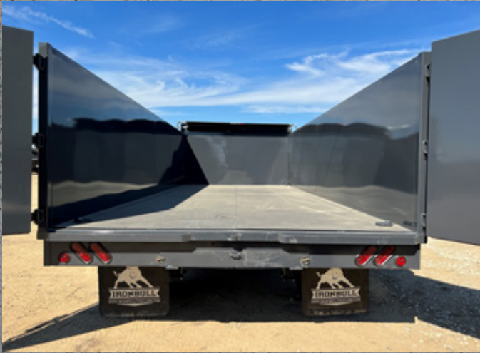
96" LONG 2 X 3 1/4" TUBING RAMPS