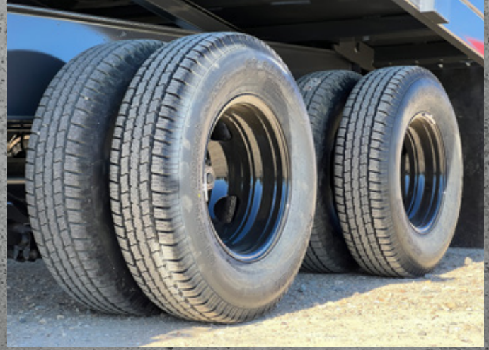
HEAVY DUTY SUSPENSION SYSTEM