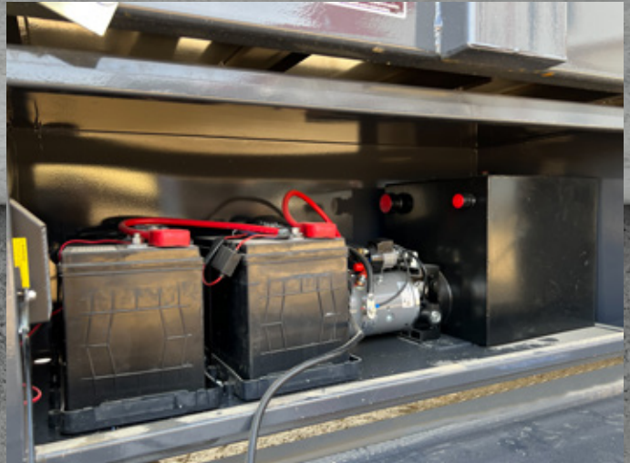
LOCKING BATTERY & PUMP BOX