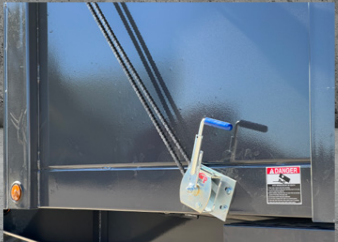
T80 MANUAL TARP SYSTEM