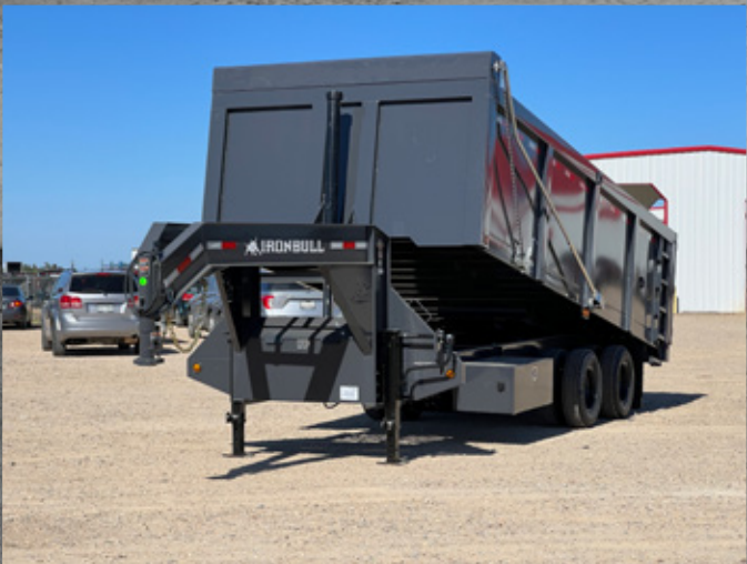
12" 19 LB FRAME, NECK & RISERS