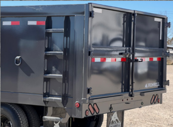
SIDE STEP LADDER & BARN DOORS