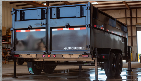
3' & 4' Sides Available