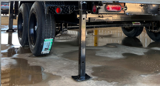
Available Rear Supports