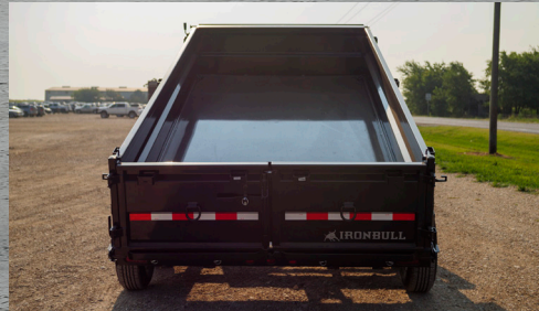
7 Gauge Floor Standard