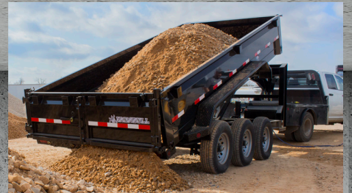
Triple Axle Available