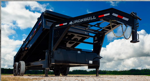
Full Length Bed Runners