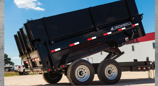
Available Side Extensions