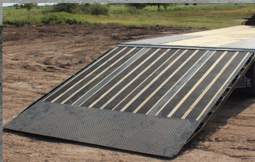
Blackwood Floor Option