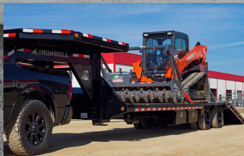
Up to 15k Axles