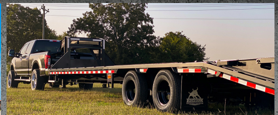
2 - 12K Electric Brake Axles