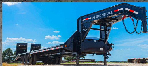
Triple Axle Configurations