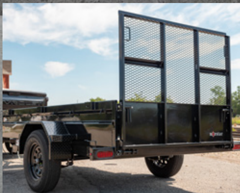
48" Fold-In Gate

Taking the field by storm is the ALL-NEW Norstar DUB. This first ever utility dump trailer comes standard with a hydraulic cylinder, 4' fold-in gate, adjustable coupler with the same heavy duty build that you have come to expect to get from Iron Bull.