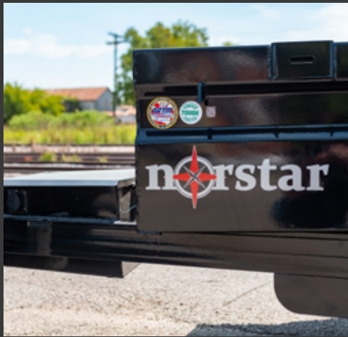
4" CHANNEL FRAME

*W/ CYLINDER, 4" CHANNEL FRAME & TOOL BOX **W/O CYLINDER, 3" CHANNEL FRAME & TOOL TRAY