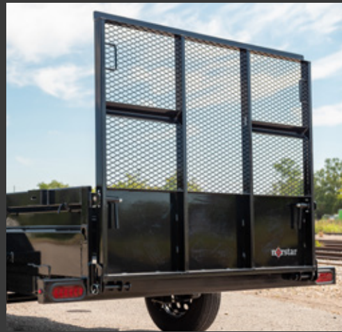
2" X 4" TUBE REAR BUMPER