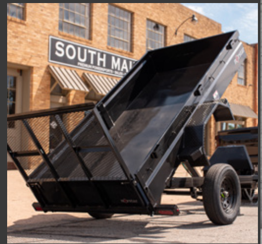
12GA STEEL SIDES