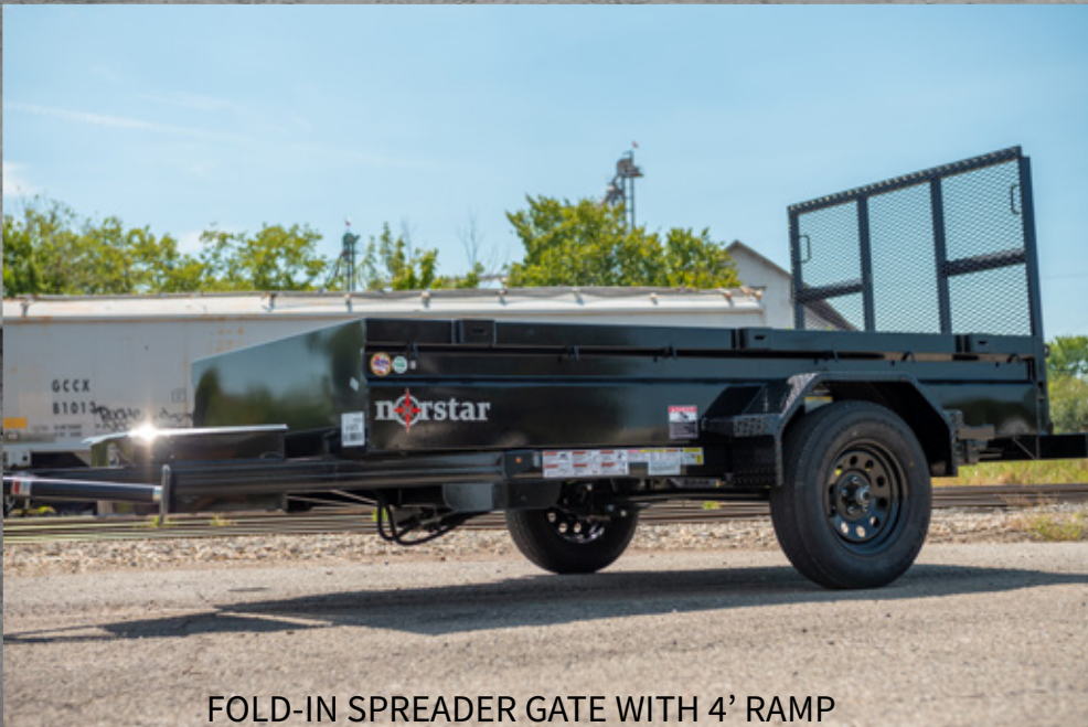
FOLD-IN SPREADER GATE WITH 4' RAMP