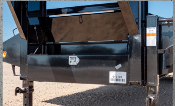
Front Toolbox Between Neck