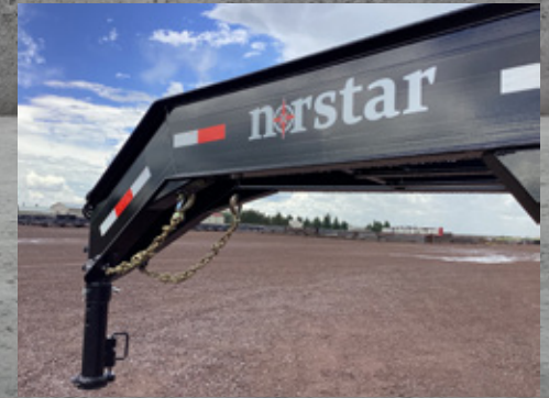
12" 19lb I-Beam Neck