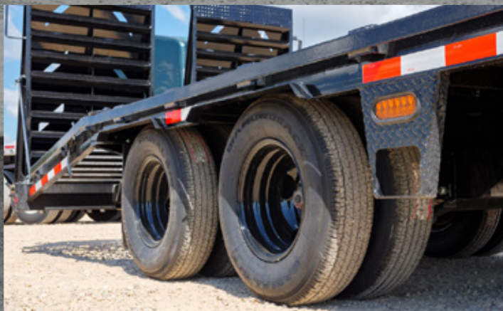
2- 10k Electric Brake Axles