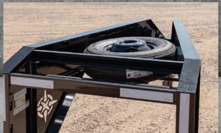
Spare Tire (Standard On Tandem Duals)