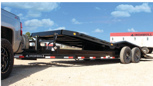
Full Power Tilt