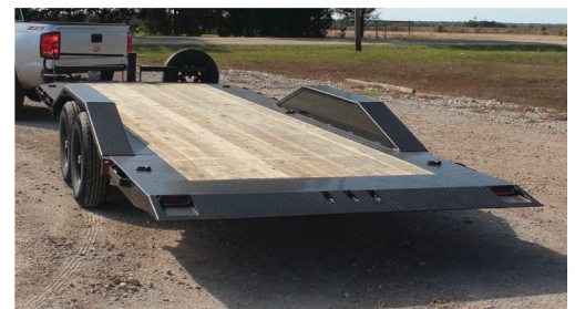
102" Wide Deck Available