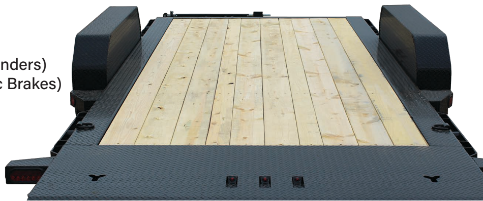
Knife Edge Tail