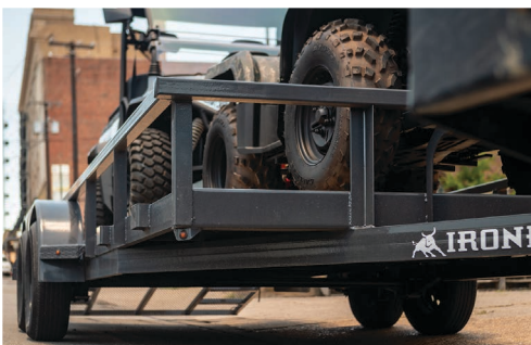
2" x 2" Top Tube Rail