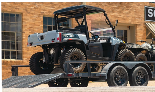
Tear Drop Tandem Fender