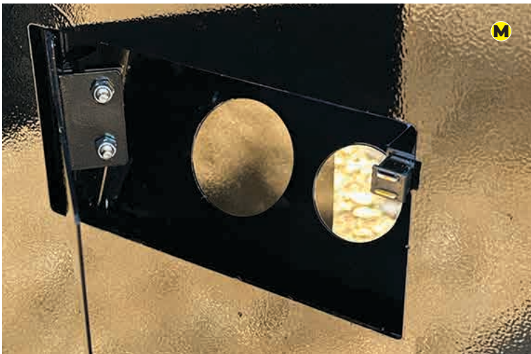
FUEL FILLER DOOR

*WEIGHT OF UNITS ARE APPROXIMATES ONLY AND SUBJECT TO CHANGE DEPENDING ON OPTIONS