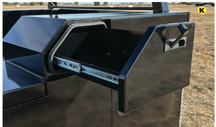
ANGLE BOX PULL OUT TRAY