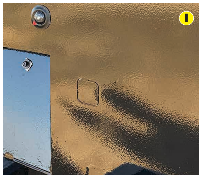
SPARE TIRE KNOCK-OUT