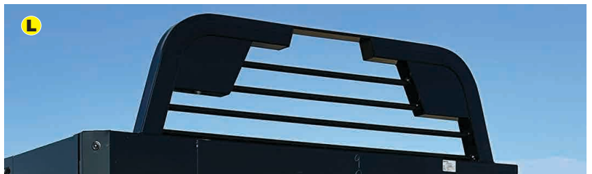
HEAD RACK NOTCHED FOR TRUCK 3RD BREAK LIGHT VISIBILITY