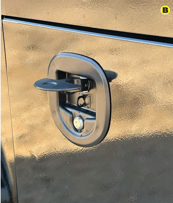
WHALE TAIL COMPRESSION LATCH