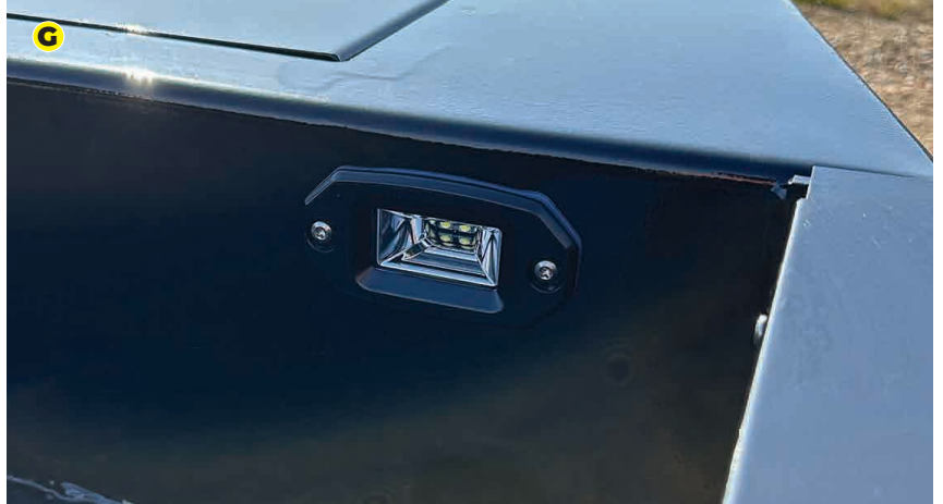
CARGO LIGHTS ON THE DECK/INNER CABINET