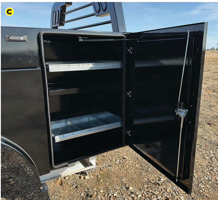
3 POINT LOCKING SYSTEM