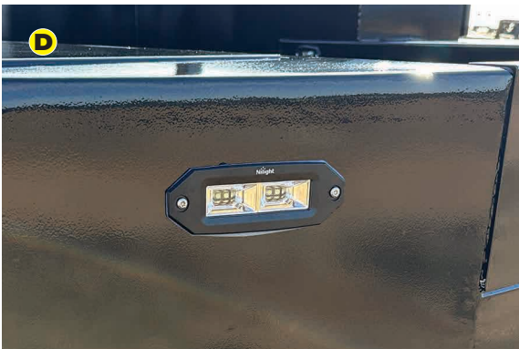
FLUSH MOUNT REAR WORK LIGHTS, 3600 LUMENS