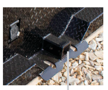
A. Steel Tube Head Rack B. 1/8" Diamond Plate Floor C. Full LED Lighting D. DEF Ready E. Rub Rails & Stake Pockets F. 30k Rated 2 5/16" GN Ball G. Available Bale Spikes H. Diamond Plate Rear Skirt I. Skirted Rear Bumper with Anti-Slip Step