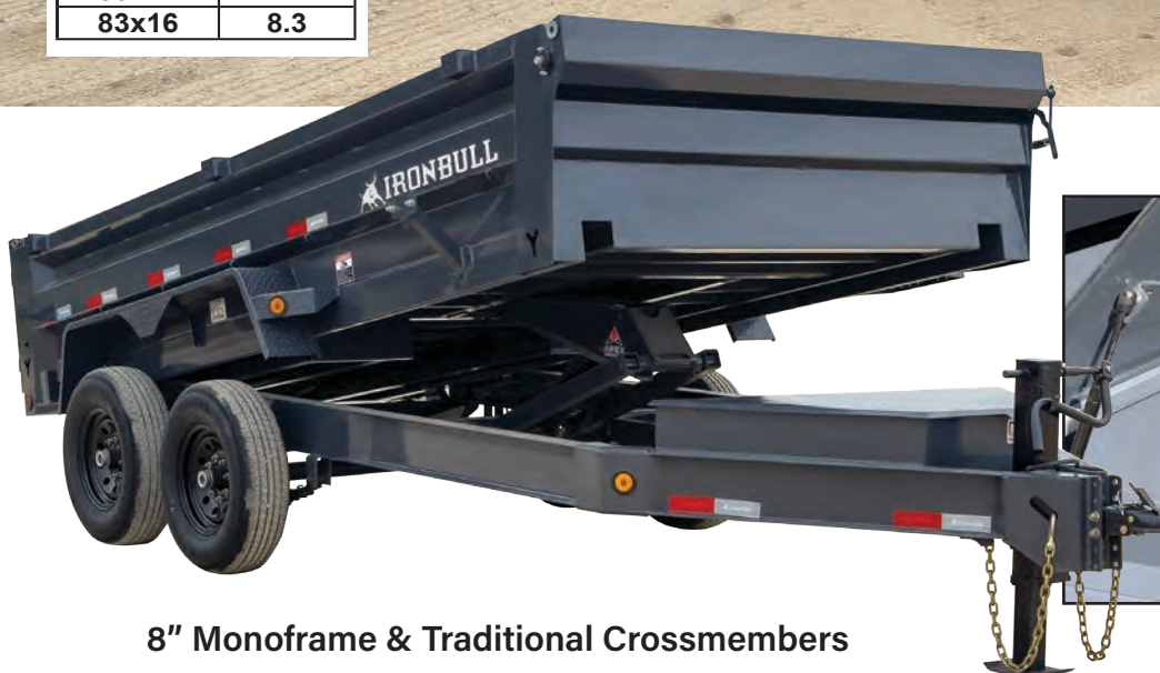
8" Monoframe & Traditional Crossmembers