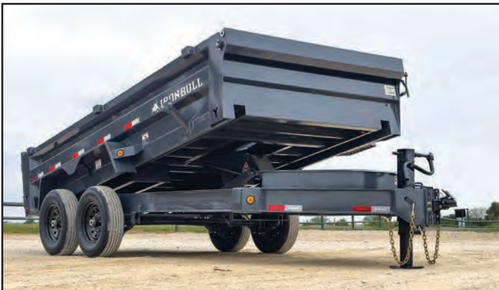
516 Scissor Hoist