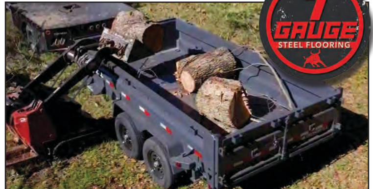
7 Gauge Steel Flooring