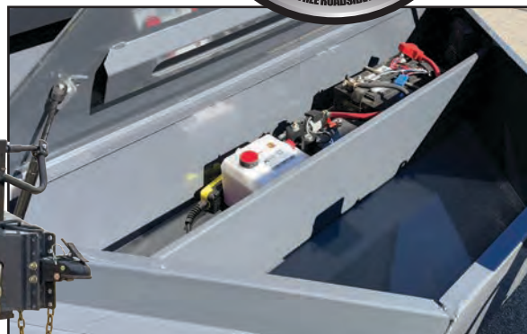
Oversized Front Toolbox

5500 FM 38N, BROOKSTON, TX 75421 • NORSTARCOMPANY.COM