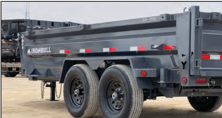
Side Armor™ System